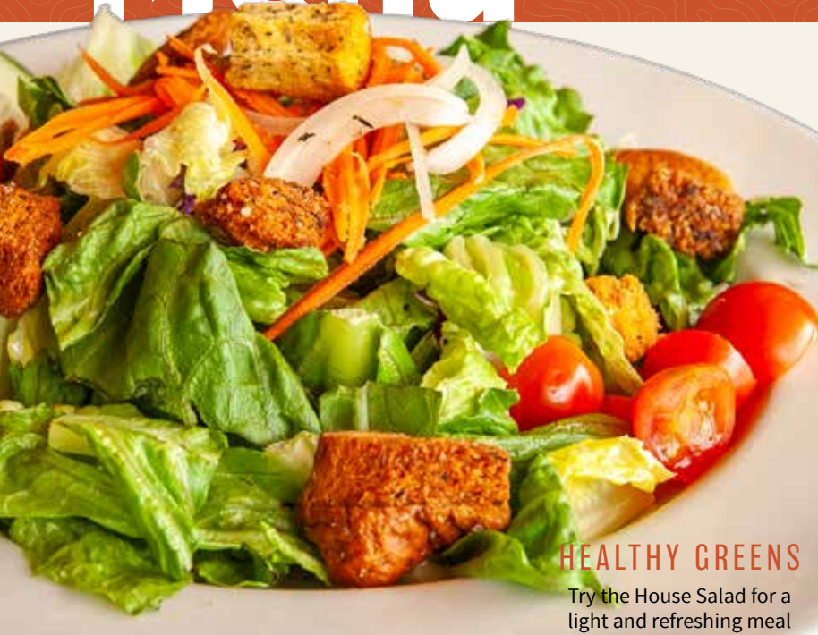
HEALTHY GREENS Try the House Salad for a light and refreshing meal