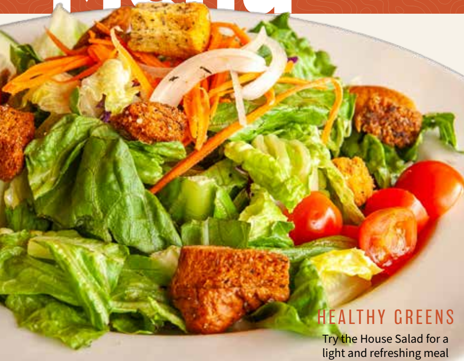
HEALTHY GREENS Try the House Salad for a light and refreshing meal