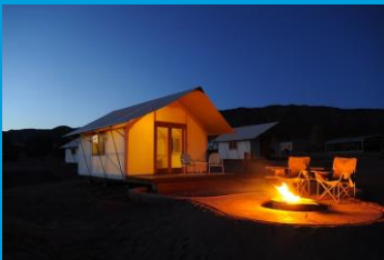
Royal Gorge Cabins and Glamping Tents opened earlier this year.