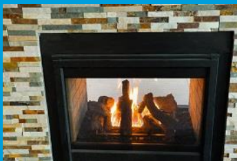
The cabins feature indoor/outdoor fireplaces.