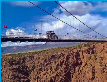
The Royal Gorge Bridge & Park is near the Echo Canyon River Expeditions headquarters.