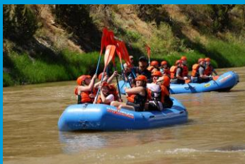
Options include smooth water to large rapids.