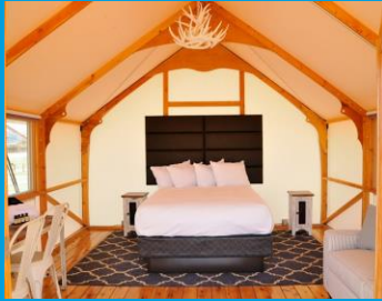
Glamping Tents feature one or two queen beds.