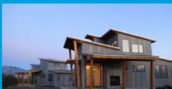
Freestanding Royal Gorge Cabins have one or two bedrooms.