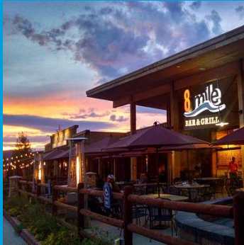
The 8 Mile Bar & Grill is open on weekends and features more than half of its tables outside.

Canyon. “Even though we received word we could open on Thursday, we were well-prepared to handle the demand.”