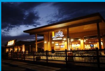
The 8 Mile Bar and Grill serves lunches and dinners.