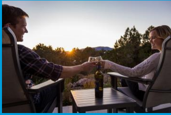
Cabins feature private patios.