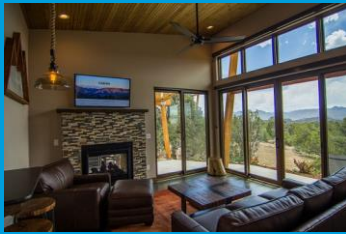
The one- and two-bedroom cabins are positioned to maximize mountain views.