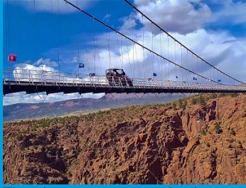
The glamping tents and cabins are located just minutes from the Royal Gorge Bridge & Park.

Royal Gorge Cabins are owned and operated by Echo Canyon River Expeditions , one of the oldest and largest tourism companies in the Royal Gorge region. Named one of the country's top adventure resorts by U.S. News & World Report , the resort offers a variety of whitewater rafting adventures on the Arkansas River, full-service restaurant and bar, event space and campsites in addition to the cabins and tents.