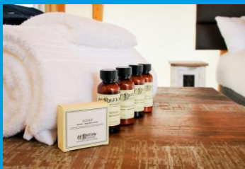
The glamping tents feature amenities such as plush towels and high-end toiletries.