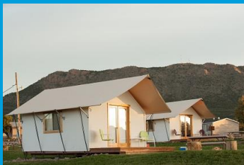
Introduced this year the Royal Gorge Cabins and Glamping Tents proved to be very popular.