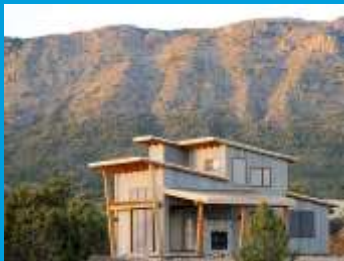
Royal Gorge Cabins offer the area's most luxurious overnight accommodations.