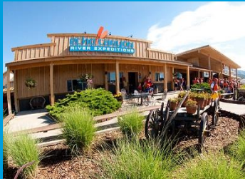
The 8 Mile Bar & Grill is the gathering spot at the end of a day on the river.

however, come from all over, and the criteria used to evaluate them can be surprising.