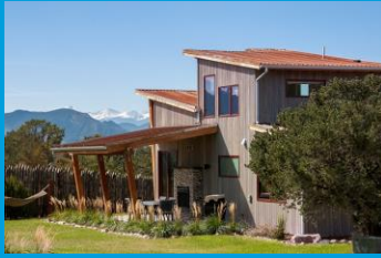
The new cabins are the nicest accommodations in the area.