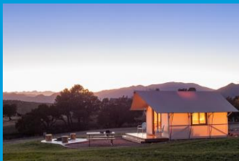
Echo's Royal Gorge Cabins feature glamping tents that have quickly become popular.