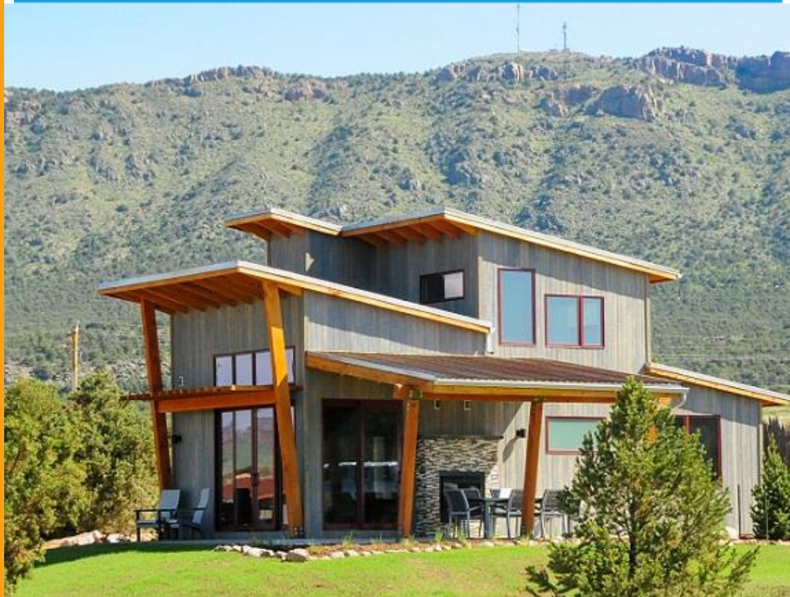
Royal Gorge Cabins offer freestanding accommodations with privacy, comfort and great views.