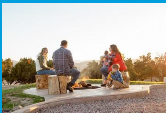
Glamping Tents come with fire rings and patios.