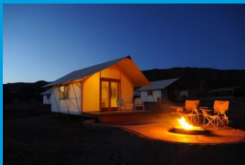
Echo Canyon opened glamping tents and luxury cabins this year.