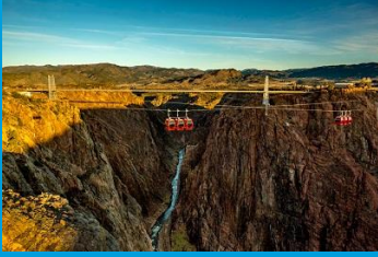
The Royal Gorge Bridge & Park is one of the area's top attractions.

The region is known as “Colorado’s Banana Belt.” With typically moderate winter-season temperatures - sometimes as warm as 60 degrees, but nearly always in the 40s and 50s - and plenty of sunshine, the Royal Gorge Region is within an hour of Colorado Springs and two hours of Denver.