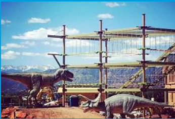
The Dinosaur Experience is educational and fun.